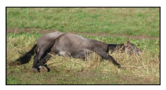
Photo 8. Horses need to lie flat on their side to enter deep sleep. The natural position is to extend the legs, neck and head.

Horses have different phases of sleep. In particular, horses require a phase of sleep during every 24-hour period where they are lying down on their sides with their limbs extended and their muscles relaxed. To achieve this they need to feel safe, have enough space and a dry lying area. It is important to keep this in mind for the size and type of accommodation for horses.