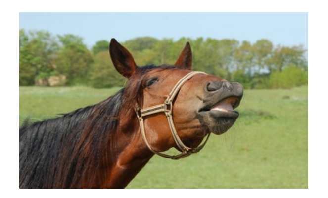
Photo 3: Flehmen enables the horse to investigate a scent more closely

Horses are gregarious/herd animals. Under natural conditions horses live close together in stable groups. The groups typically consist of one, or sometimes more than one, adult stallion and a number of mares with offspring, including young males. Young stallions and older stallions without a group of mares also group together. The group stabilises itself with a social order, which is challenged when new members are introduced. A new social order is typically formed within a few days to weeks. Living in stable groups has a number of advantages, mainly in relation to social transmission of behaviour, seeking feed and water, and a defence strategy to avoid or minimize encounters with predators. As an example, all horses of a group rarely lie down together. One will remain standing and guard the group. Horses will generally become anxious and insecure when isolated from other horses. In domestic horses, lack of social contact both early and later in life may cause development of abnormal behaviour such as weaving in stabled horses, or more aggressive interactions when on pasture with other horses. Furthermore, group housed young horses are easier to handle and train than young horses kept individually.