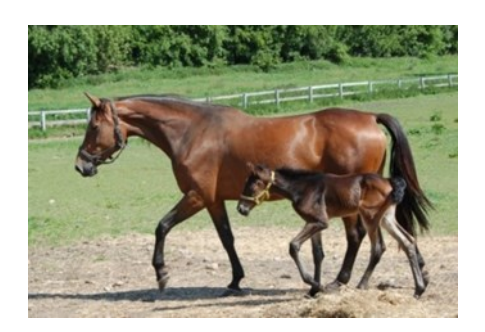
Photo 29 and 30. Foals should drink colostrum within a few hours after birth, and they should be given time in a paddock or on pasture from day one.

Colostrum protects the foal from possible disease agents in the environment. It is therefore vital that the foal drinks milk from the mare within a few hours of birth. If this isn't possible, for example due to a problem with the mare, then veterinary advice should be sought without delay.