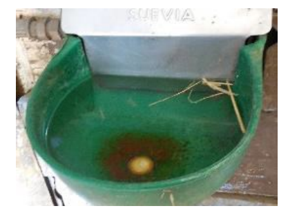
Photo 20. Water cups should be checked daily for cleanliness and functionality