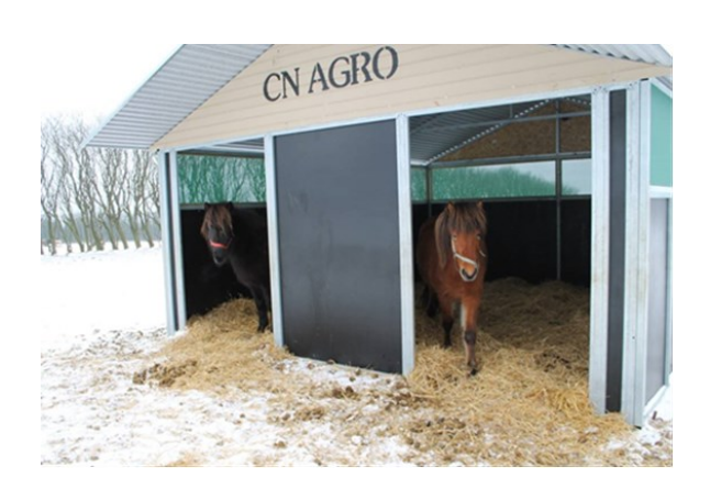
Photo 15. Shelter should be large enough to provide protection to all horses at the same time

Sufficient shelter may be provided by the natural surroundings, such as trees, hedges or other natural vegetation or by purpose-built shelters.