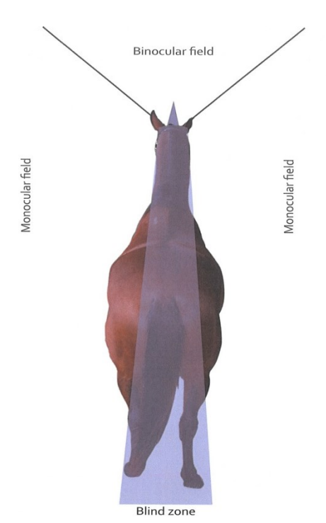
Photo 2. The field of vision of an equine, showing the binocular vision in front, the monocular vision at the side, and the blind spot behind and underneath the equine.

There is a small "blind area" just behind and underneath a horse. As the eyes are not very mobile, horses need to move their heads to see what is happening in the area of the blind spot.