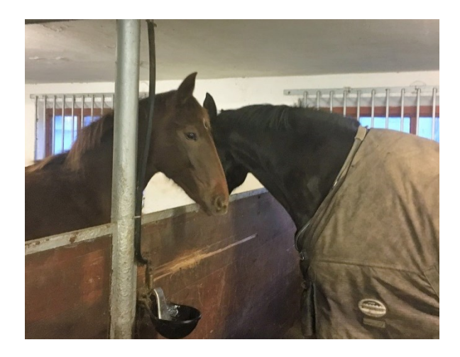
Photo 12. Individual boxes, which allows horses to touch each other.

Individual (loose) boxes should be dimensioned to fit the size of the horse, so that the horse can lie down in a natural lateral position (see photo 8), turn around and get up unimpeded, and stand in a natural position. Boxes for foaling or boxes for a mare with foal at foot need to be larger than boxes for single horses. When considering space requirements, the time the horse spends in the box should be taken into account. The box should be larger if the horse is stabled for a major part of the day. The upper part of partitions between boxes should not be solid, but allow horses in neighboring boxes to see each other and allow for adequate ventilation. Fittings, such as feeding and watering equipment, should be positioned, designed, and maintained in a way as to avoid injury to the horse, and as far as possible avoid contamination with urine and faeces.