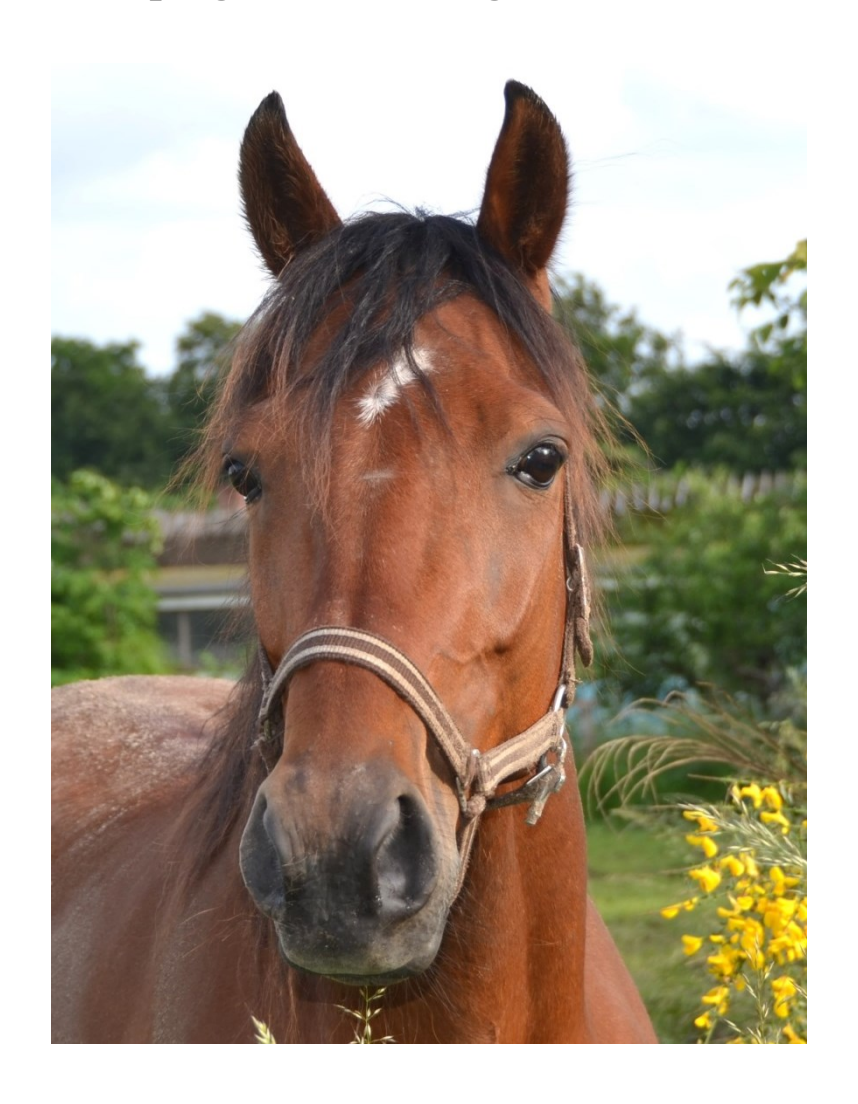
Guide to good animal welfare practice for the keeping, care, training and use of horses