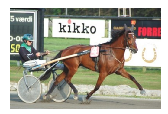
Photo 18. Some groups of horses may need to be supplemented with high energy feed.

Many horses can live on grass or roughage alone, supplemented with vitamins and minerals if necessary. Some groups such as sport horses, young, growing horses or horses meant for breeding purposes may have a need for a higher energy consumption due to their level of exercise or basic needs. Therefore, they may need to be supplemented with high energy feed (concentrate).