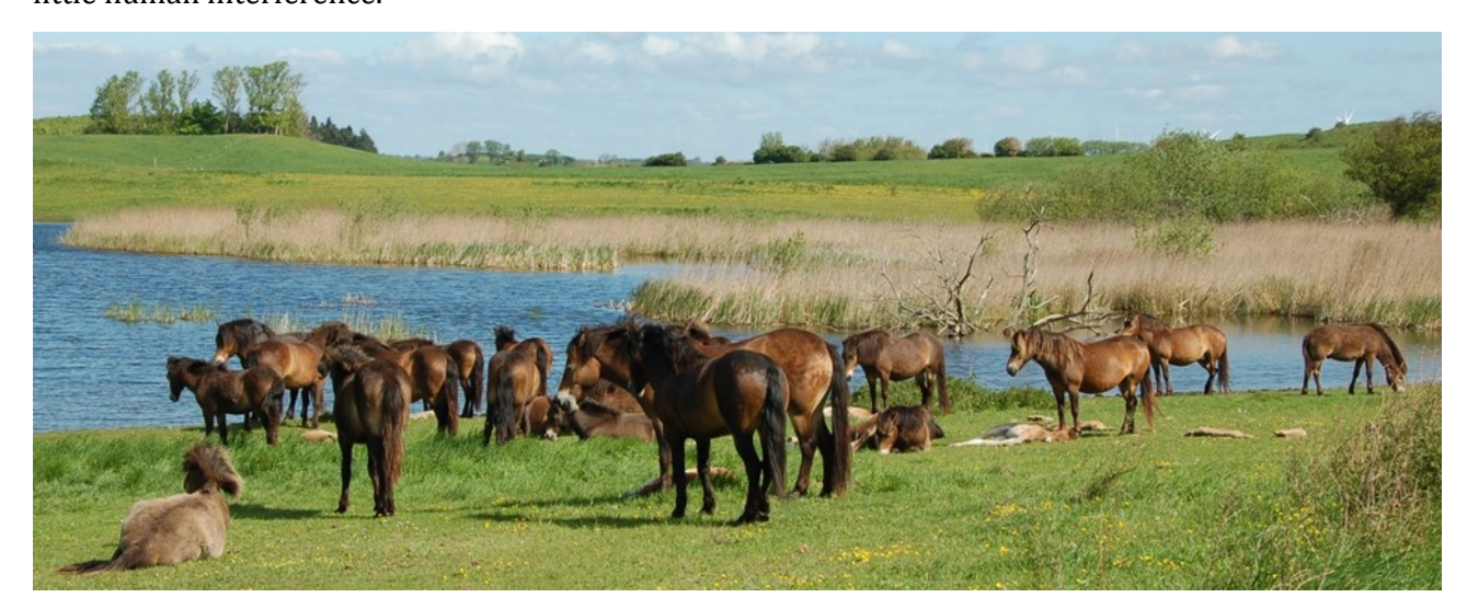
Photo 1. Knowledge on the natural behaviour of horses derives mainly from studies of feral horses.

Today's domestic horse, the Przewalski's horse and other feral or wild horses such as the now extinct tarpan, share a common ancestor. Knowledge on natural horse behaviour derives partly from studies on Przewalski's horses reintroduced to their original habitat, but mainly from studies of feral horses - offspring of escaped domestic horses that live under natural or semi natural conditions with no or little human interference.