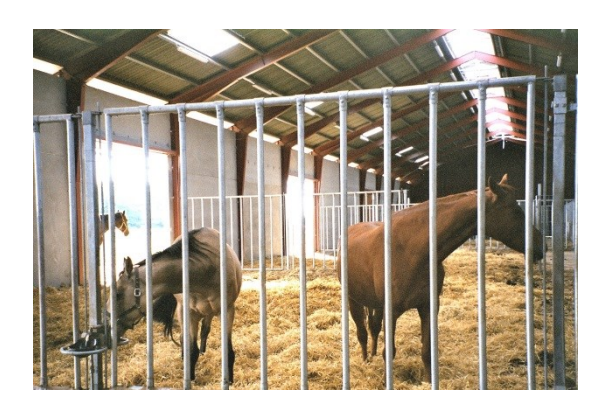
Photo 14. Horses in a group housing system with access to an outside run.

In group housing systems the total floor area should allow free movement, sufficient access and space at feeding and watering stations, and ensure a dry bedded area large enough to allow all horses to lie down undisturbed at the same time. Fittings to allow temporary tethering of horses, for example when a concentrate ration is fed, should be considered. Care should be taken to select groups of horses that are compatible. Ill or injured horses or horses with deviating behavior (for example aggressiveness) should be managed accordingly and group housing may not be suitable for such individuals. Facilities for temporary separation of individuals should always be available. The design of the group housing system should ensure that all horses are able to move away from each other and to access feed and water at any time. Dead-ends and sharp corners should be avoided to prevent horses from being trapped.