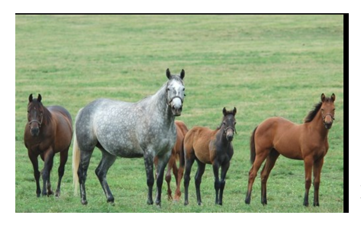
Photo 16. It is recommended that horses are given daily access to a paddock or pasture, where possible with other horses.

It is recommended that all horses should be given daily access to paddocks or pasture, where possible together with other horses, in order to fulfill their need for free movement and social contact. However, there may be situations where veterinary advice or extreme weather conditions make this contradictory.