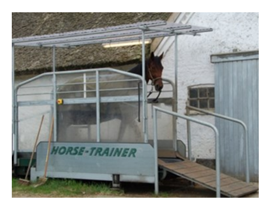
Photo 21. Horses should be supervised by a competent person at all times when exercised on a treadmill

Mechanical equipment such as horse walkers and treadmills are used for exercising horses.