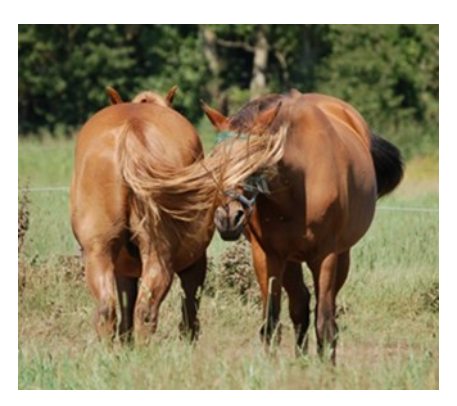
Photo 7. Horses standing close to keep insects away from each other's head.

Although horses are social animals, they have a social space, which defines the distance that they wish to keep from other horses. This distance is individual, and is dependent on age and on how well the horses know each other. During social grooming, for example, the distance is zero. Horses may also be seen standing close together when trying to keep insects away. Foals and young horses appear to have a very narrow or less developed social space and they may be seen lying close together. When horses are group housed, it is important to take social space into account when deciding how much space they should be given.